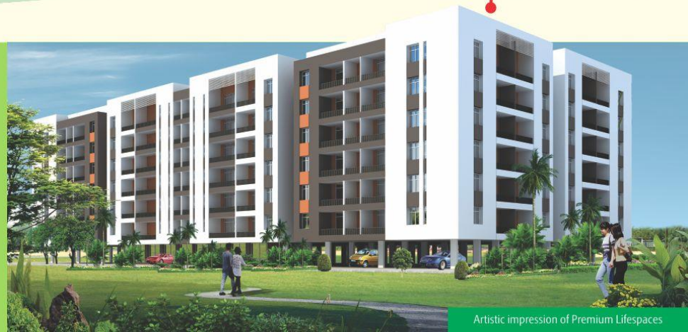
Artistic impression of Premium Lifespaces